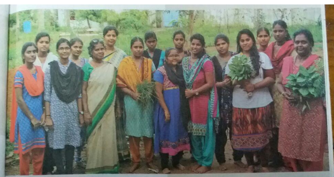
் களத்தில் கல்லூரி மாணவிகள்

ஒண்ணே கால் ஏக்கர் நிலம் வாங்கி விவசாயத்தை ஆரம்பிச்சேன்.